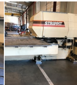
Strippit Punch Press Accurate punch press for random and repeat patterns