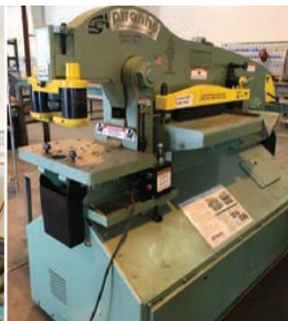
Piranha Ironworker Precise, burr-free cuts and clean notches