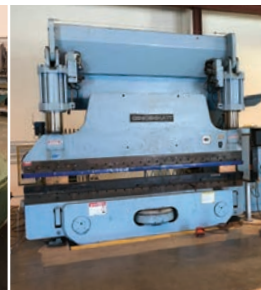
CNC Press Brake Press Form predetermined bends on sheet and plate material