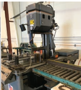
HEM® Saw Vertical, heavy-duty, metal-cutting production band saw