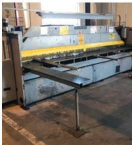
Betenbender Shear Razor-sharp cutting shear