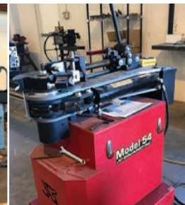
Model 54 Pipe Bender Bend solid and hollow tubing in a broad spectrum of sizes